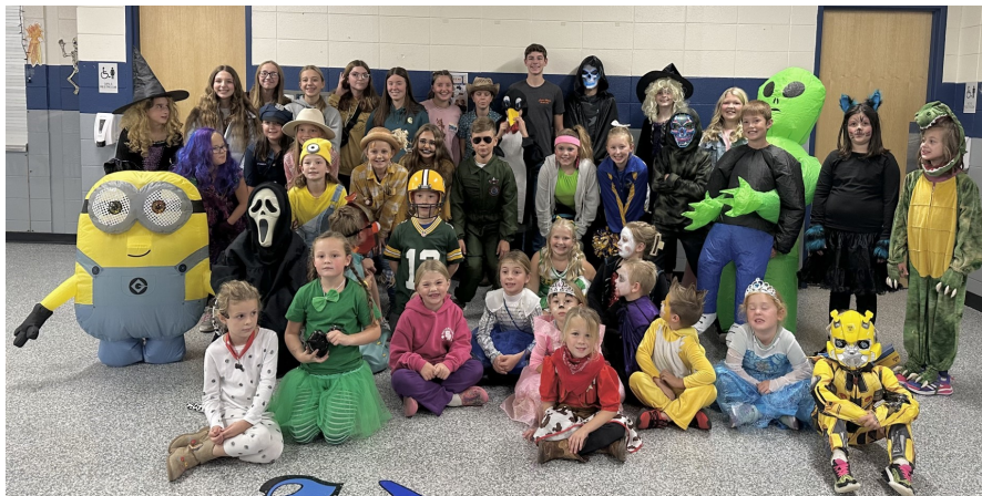
Hazel Green Clever Clovers 4-H Club

In October, the Hazel Green Clever Clovers dressed up in their Halloween costumes to attend the meeting. During our meeting we played mummy wrapping, pin the stem on the pumpkin and musical chairs. Prizes were given for best costumes and most creative pumpkin decorating.