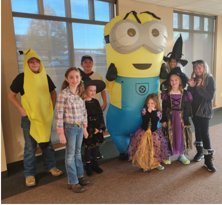
Platteville Woodchucks 4-H Club