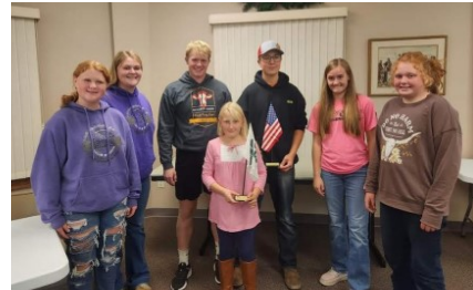
Plum Valley Boosters 4-H Club - Officers

The Platteville Woodchucks met October 22 for the first meeting of the year where officers were elected. The meeting ended with a costume contest and the winner received a pumpkin. Next meeting is November 12 at Wisconsin Bank and Trust.