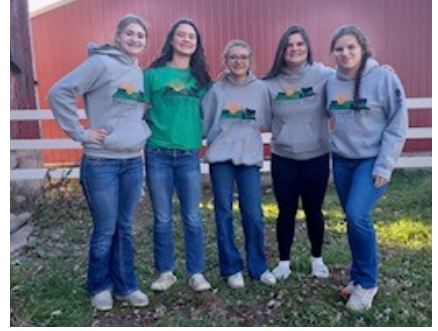
Thousand Hills 4-H Club - Officers