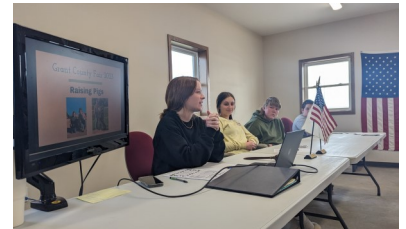
Cornelia Badgers 4-H Club