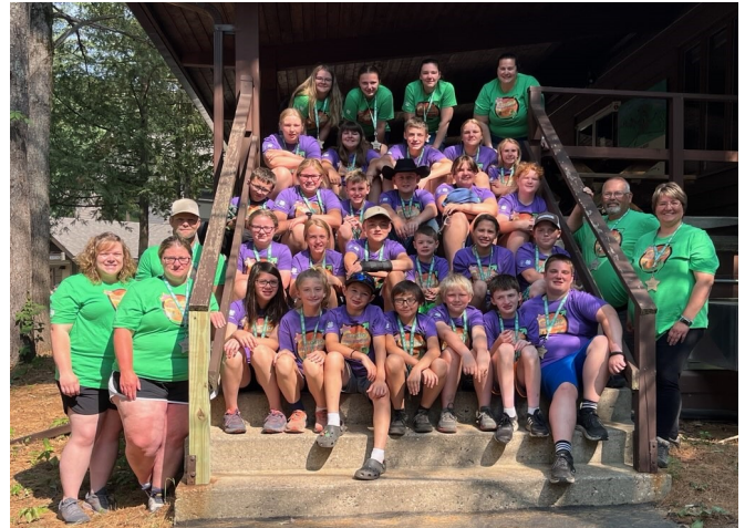
2023 4-H Campers at Upham Woods

https://fyi.extension.wisc.edu/uphamwoods/home-page/programs/summer-camp/