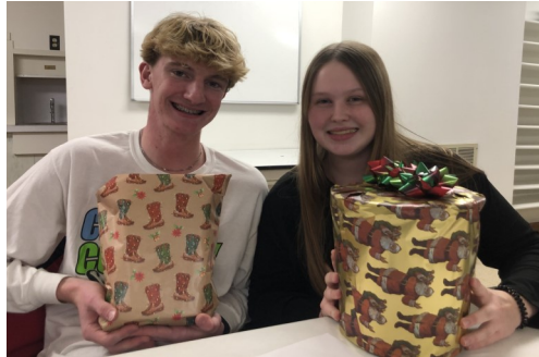
Blake's Prairie Bombers 4-H Club